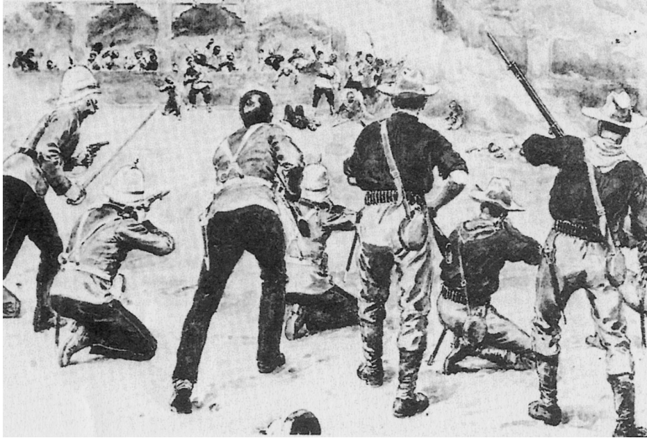
An illustration of the siege of the British Legation in Beijing during the Boxer Rebellion in 1900.

24 Study the illustration, and then answer the questions which follow.